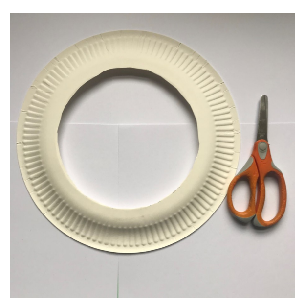
Step 2. Cut the centre out of the paper plate so you are left with a ring.