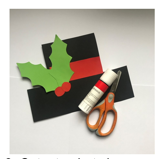
Step 3. Cut a top hat shape out of the black card, then use the other card to add some decoration.