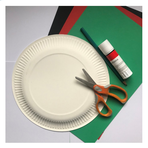
Step 1. Gather your materials. You will need a paper plate, coloured card (see pic), scissors, a pencil and some glue.