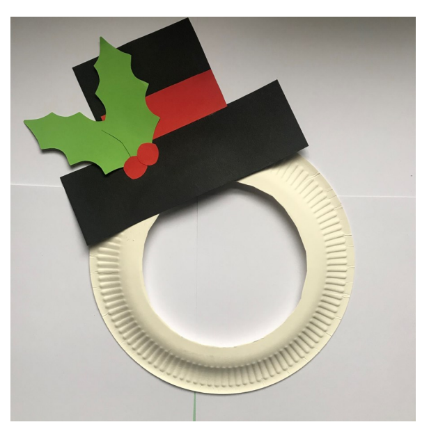
Step 4. Glue the top hat onto the paper plate ring.

You have finished your snowman, don't forget to share what you have made with us #SpikeDinosAdventures