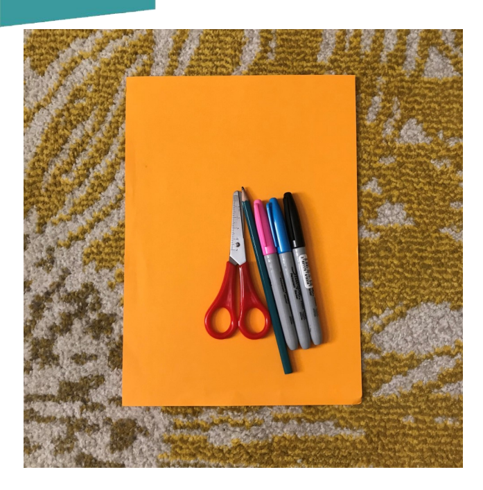
Step 1. Gather your materials, you will need a piece of card, scissors, a pencil and some coloured pens.