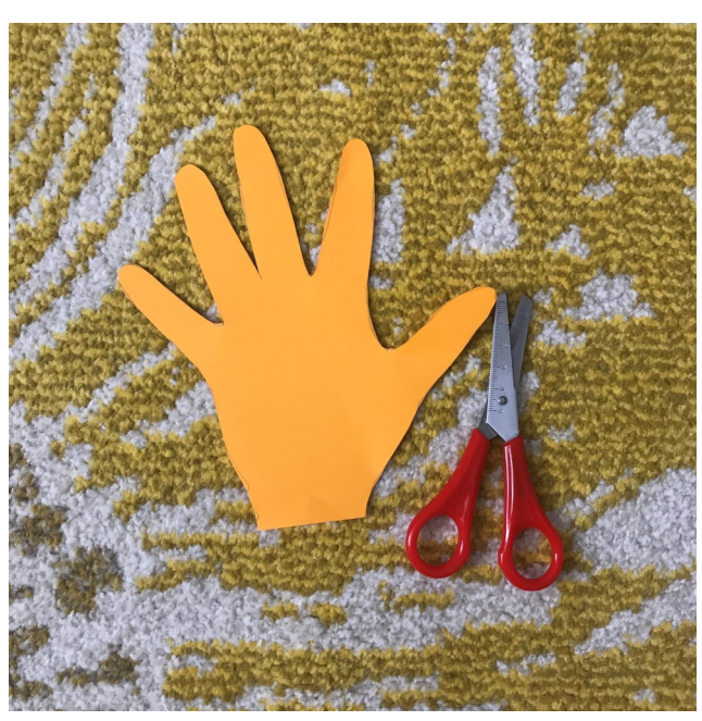
Step 2. Draw around your hand and then cut it out.