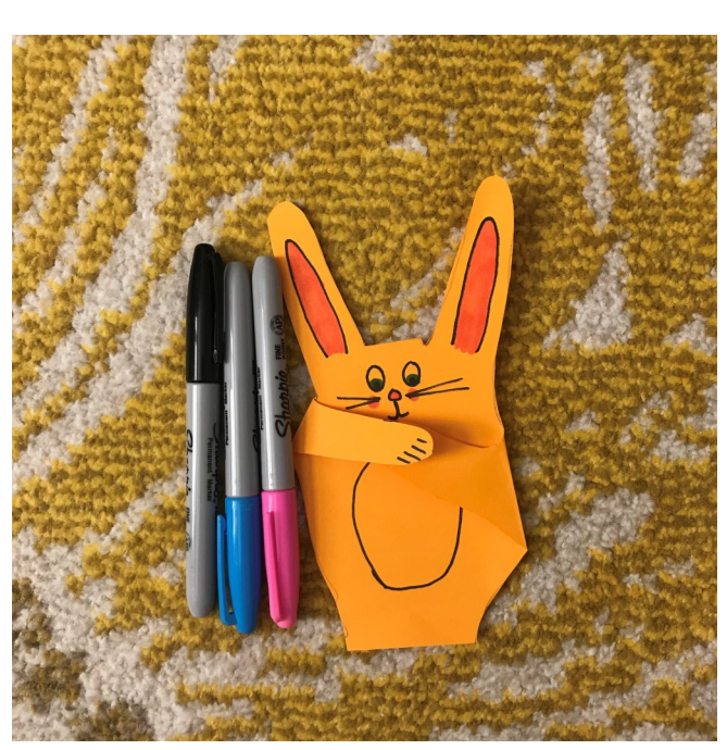
Step 4. Now use the coloured pens to add decoration to your bunny.