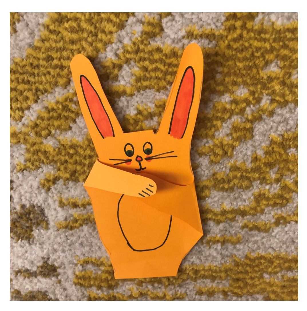
Step 5. You have finished your bunny, don't forget to share what you have created with us #SpikeDinosAdventures