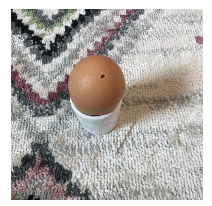
Step 2. Ask an adult to use the needle or the straightened paperclip to gently poke a hole in each end of the egg. You can place a small piece of tape at each end to help stop the egg from cracking.

Step 3. Ask an adult to use the needle or paperclip to push inside the holes to make sure that the yolk is broken.