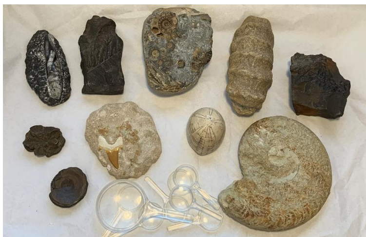
Image of Maidstone Slab