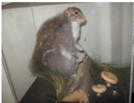
Grey Squirrel in Perspex box