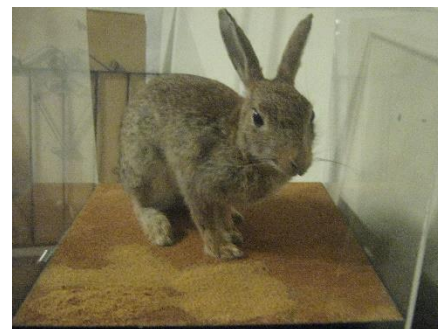
Grey Rabbit in Perspex box