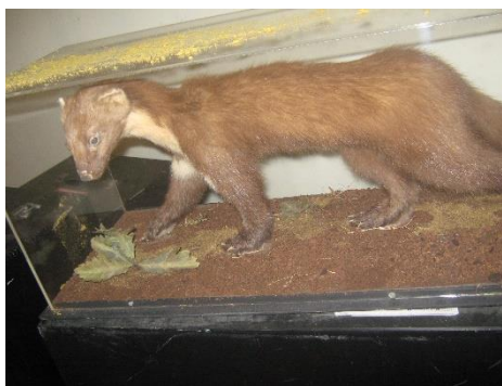
Pine Martin in Perspex box