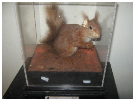
Red Squirrel in Perspex box