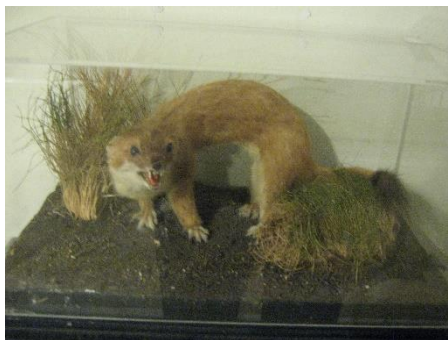
Stoat in Perspex box