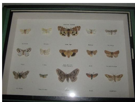
British Moths in Perspex box