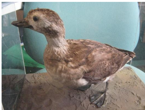
Long tailed Duck in Perspex box