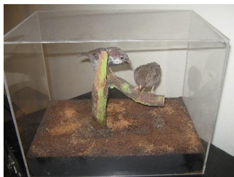
House Sparrows in Perspex box