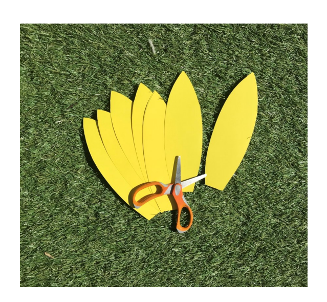
Step 3. Use the yellow card to create the petals of your sunflower.

Step 2. Cut out the middle of the paper plate to create a ring.