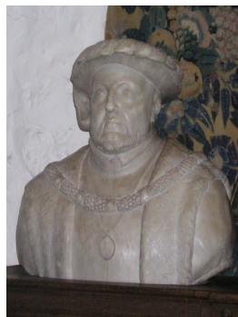
Henry VIII - on display at Leeds Castle.

Activity—activity make a model of yourself or family from plasticine, playdough, clay or collage or recyclable materials.