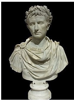
Augustus - made in 25BC from marble. It is on display in a French museum.